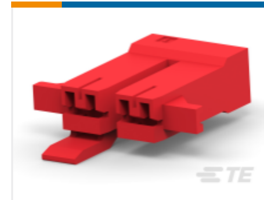
TE Part # 353253-2 PL EX 110 (2.8 MM) HOUSING RECEPTACLE