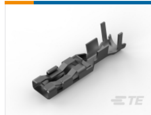
TE Part # 353250-2 110 PL EX REC. 20-16AWG PTPHBZ