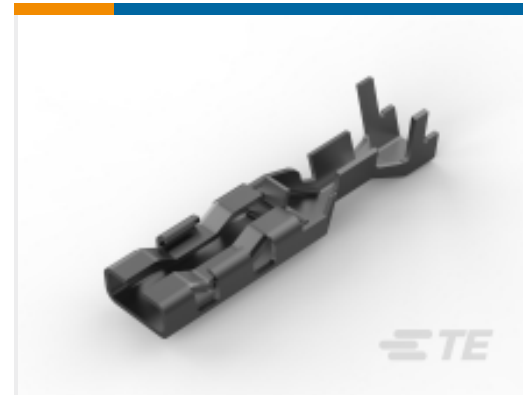
TE Part # 353249-2 110 PL EX REC. 26-22AWG PTPHBZ