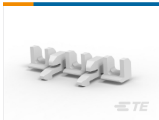
TE Part # 353256-1 110 HSG. PL EX REC. 7.6mm 3P NAT